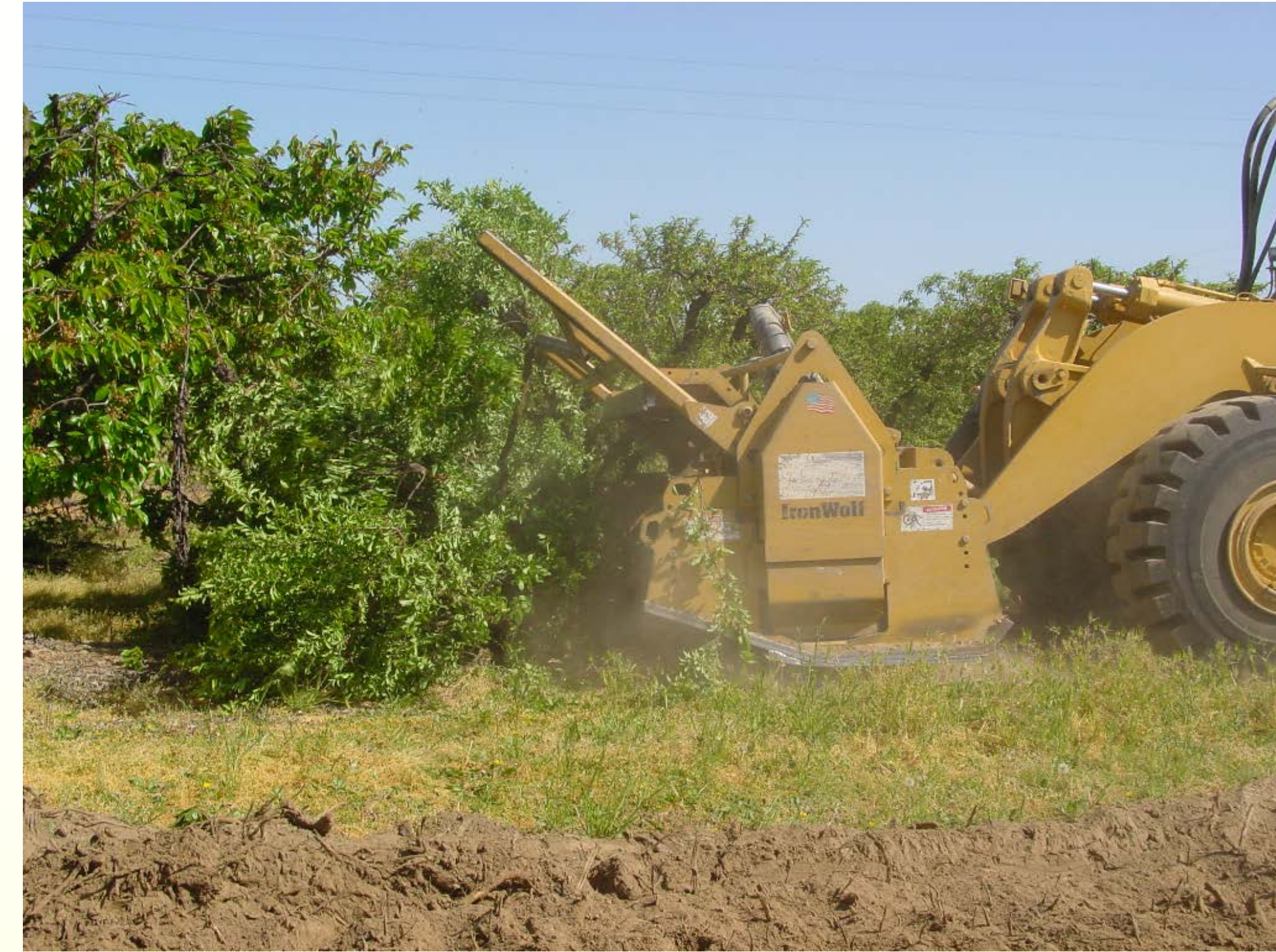
Tree being pushed over and ground in place by the 'Iron Wolf'

Twenty-two rows of an experimental orchard on nemaguard rootstock (field #31) at the UC Kearney Agricultural Center, Parlier, CA were used in a randomized blocked experiment with two main treatments, whole tree grinding and incorporation into the soil with "The Iron Wolf" (a 50-ton rototiller) versus tree pushing and burning (completed March/April 2008). Subplots within these two main treatments above included tree site fumigation with Inline (61:33 ratio of 1,3-dichloropropene and Chloropicrin) through the micro-irrigation system versus a non-fumigated control (completed October 2008). There are 7 replications of each treatment and each replication or plot consists of 18 trees. Almond trees (Nonpareil, Carmel, Butte) were planted in January/February 2009. Tree growth was measured by trunk diameters and current season shoot growth twice throughout the year.