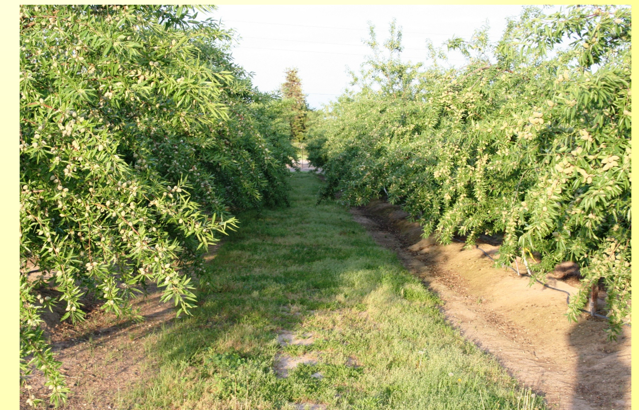
Fourth leaf second generation almond replants trees growing in grind and burn plots at the Kearney Agricultural Center.

In 2011 the electrical conductivity, cation exchange capacity, organic matter, and carbon were no longer significantly less in the grind treatment plots. In 2010 the Grind treatment plots had significantly more manganese and iron in the top 5 inches when compared to the burn treatment plots.