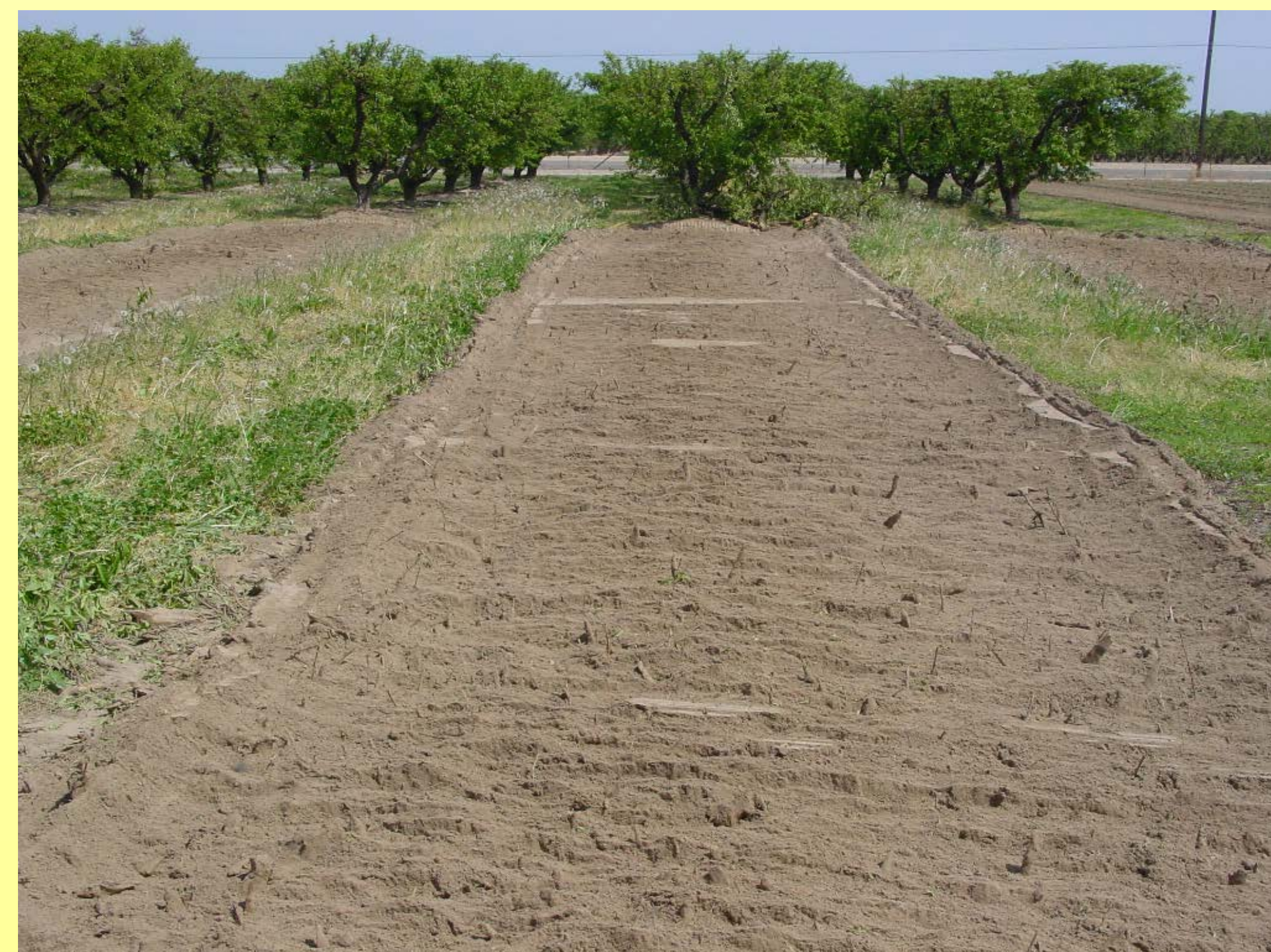
Tree row after incorporation into the soil with the 'Iron Wolf'

Tree circumference from second generation replanted trees showed no effect in tree growth between trees growing in plots where whole tree grinding had been performed when compared to trees in plots where the previous orchard had been burned. Yields were determined in 2011 (3 rd leaf trees) and 2012 and there were no significant differences between treatments burning or grinding. No significant differences were observed in mid-day leaf stem water potential readings between treatment trees.