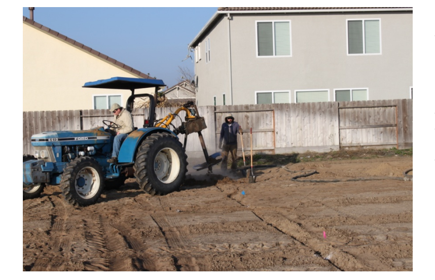
Figure 3. Two new orchard replant trials were initiated in January and February 2012 near Atwater and Livingston, CA. The Livingston site (left) is in an orchard next to a housing subdivision; this area cannot be fumigated with any conventional treatments due to buffer zone restrictions. Both new trials include the steam auger treatment protocol used in the 2010 Atwater trail ( Table 2 ).

Figure 2. Soil temperature profiles in almond tree sites treated with the 36 inch steam auger in a replant trial near Delhi, CA in December 2010. Target temperatures over 158 F were easily maintained at 24 inches but were less dependable at a depth of 12 inches and near the soil surface.