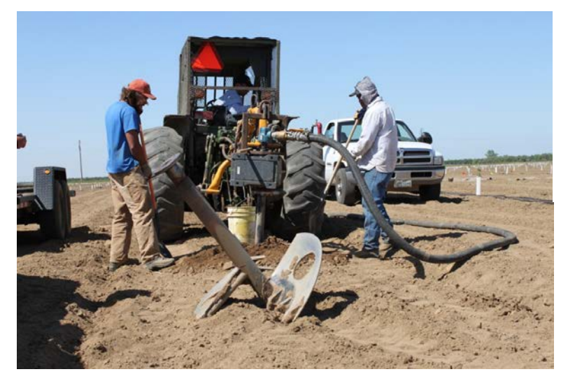
Figure 1. Redesigned steam-injection auger for treating almond tree planting sites. A 24inch diameter auger (in use) and a 36 inch auger (foreground) were tested in trials near Delhi, and Wasco in 2011 and Livingston and Atwater in early 2012. Orchard performance will be monitored during the 2012 and 2013 growing seasons.