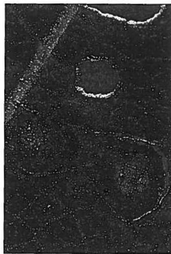
Jack Kelly Clark

Shot hole lesions on fruit first appear as small spots. On leaves, small, dark fruiting structures (sporodochia) in the center of the lesions are characteristic of the disease.